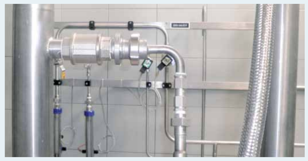
Installation of the SOLVOCARB® inline injector at the Plzeňský Prazdroj brewery.

meant that the company's traditional copper vessels were not suitable for neutralization operations. After examining the ecological, safety and process aspects of the various pH control treatment alternatives, the company decided to turn its attention to a simpler, safer, more precise and ecologically friendly alkali pH regulation agent for its new neutralization system.