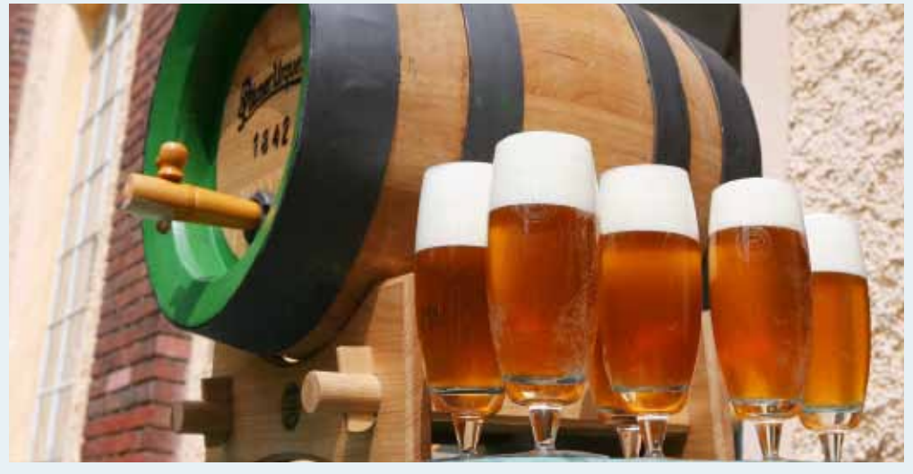
Pilsner Urquell is a premium lager that has been brewed exclusively in Pilsen for 175 years.